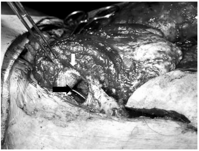
Fig. 2. Repair of anastomotic dehiscence of the gastric pull-up with aid of the pectoralis major myocutaneous flap (white arrow shows the skin edge that are reflected interiorly to be sutured to the edge of posterior wall of the anastomotic site to restore the continuity of the lumen, while the black arrow shows the lumen with a nasogastric tube inside).