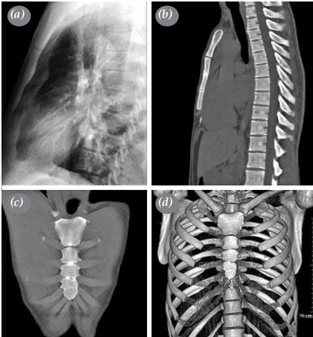
Figure 1. (a) Lateral chest radiograph of first patient demonstrating fissure lines on corpus sternum. (b) Sagittal, (c) coronal (d) and three-dimensional computed tomography images demonstrating transverse fissures dividing corpus sternum to parts.

Sternal cleft is the fusion defect of the sternum that separates the sternum partially or completely into two vertical parts. Fragmented sternum has not been defined previously. Two sternal cartilaginous bars fuse between 7 th and 10 th weeks of the fetal life. The cartilaginous sternum ossifies from six