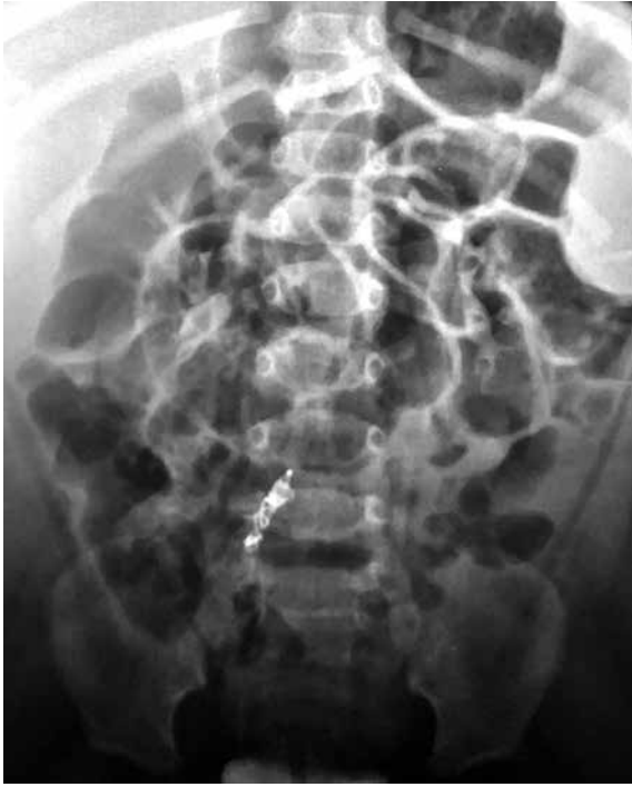
Figure 1. Posteroanterior abdominal X-ray showing embolized duct occluder device with the snare guidewire entwined and squeezed.

Occluder II, St. Jude Medical, Plymouth, MN, USA) to the RCIA (Figure 1). Additionally, the attempts for retrieval of the ADO-II were unsuccessful. We were