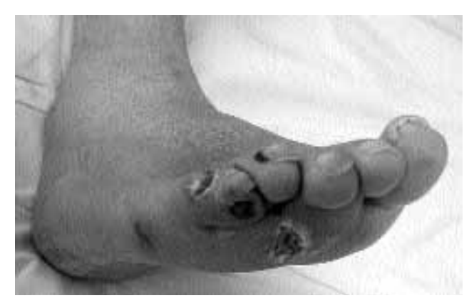
Fig. 1. Intractable ulcer on the right sole.

trations of 5 µg prostaglandin E1 (20 µg PGE1/20 cc normal saline) through a side-branch of the vein graft.