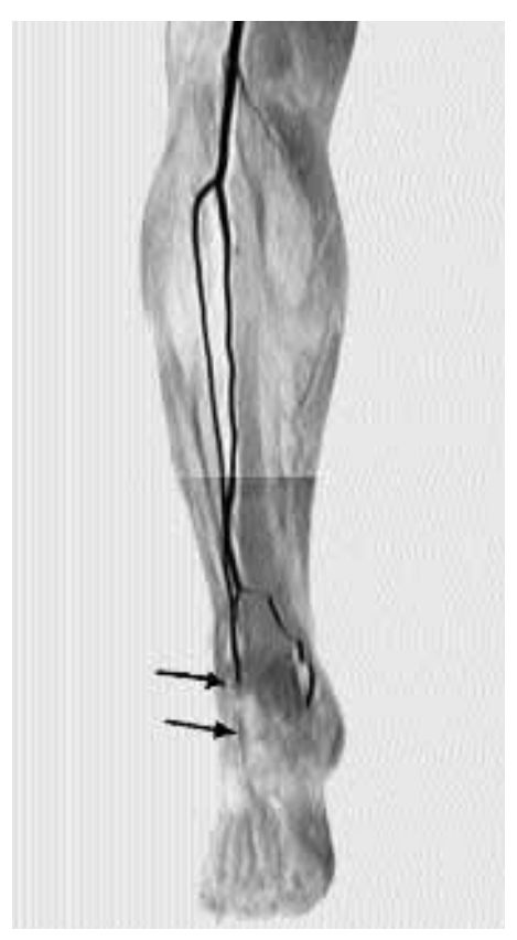
Fig. 2. Preoperative magnetic resonance angiography showing disease-free peroneal and anterior tibial arteries with abrupt occlusion of the latter in the ankle (straight arrow). The plantar arteries are occluded at their point of origin. The distal segment of the dorsalis pedis artery is patent (broken arrow).

The distinguishing feature of the present case was that, unlike the majority of the cases with diabetic atherosclerosis, plantar and pedal arteries were involved in the atherosclerotic lesion. Although a microcirculatory disorder due to an elevated level of HbA1c should also