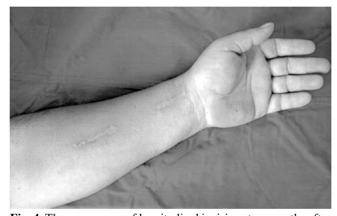
Fig. 4. The appearance of longitudinal incisions two months after operation.

The radial arteries of 14 patients were used for revascularization of right coronary system, 11 for circumflex coronary system. No morbidity and mortality was seen. After coronary bypass operations, patients underwent control angiography. There was no problem such as local or diffuse stenosis in these radial arteries in 28 to 33-month follow-up (Fig. 3) Focal stenosis was seen in diagonal saphenous graft in one patient and dilated with balloon angioplasty in the same procedure.