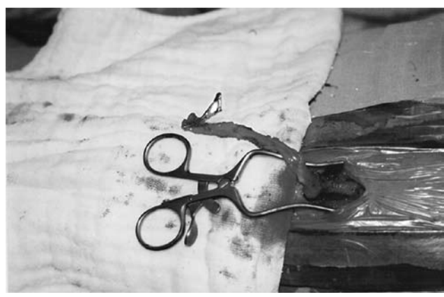
Fig. 2. Distal and mid part of the radial artery was harvested through the mid-forearm incision.

the radial artery were clipped and cut. The radial artery was not manipulated. Following heparin injection, distal end of the radial artery was cut and brought to the midforearm incision and diluted papaverine was injected by a silastic cannula as in the same way in the open method (Fig. 2). Three minutes later, radial artery flow was controlled. Then, proximal end of radial artery was doubly clipped and cut from the mid-forearm incision. In the postoperative period, the patients were observed for hematoma, neurologic deficits and incisional healing problems in donor extremities. Control coronary angiographies were performed to check graft patency.