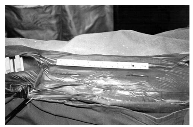
Fig. 1. Two 3-4 cm longitudinal incisions on the forearm for minimally invasive radial artery harvesting.

of 20-25 cm full forearm incision extending from wrist to elbow, first we made 3-4 cm skin incision over the distal radial artery between styloid process and flexor carpi radialis muscle tendon. From this incision, we also prepared additional 5 cm radial artery segment by the help of retractors inserted to the proximal end of this incision. Following the preparation of distal 8-9 cm of radial artery, a second 3-4 cm mid-forearm incision medial to brachioradialis muscle was made (Fig. 1). In this region, preserving lateral antecubital nerve, first we dissected all subcutaneous tissue 10-12 cm proximal to the upper end of this incision by the help of retractors pulled by an assistant. After opening the fascia between brachioradialis and flexor carpi radialis muscles, insertion of automatic retractor, arms opened under the skin, removed these muscles apart from each other over the proximal part of radial artery. Then, the side branches of