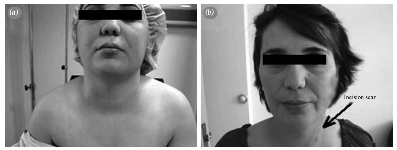
Fig. 3. (a) Preoperative and (b) postoperative view of the patient.

Abnormal thrombosis may occur secondary to deficiencies of protein S, protein C and antithrombin III.<sup>[4]</sup>