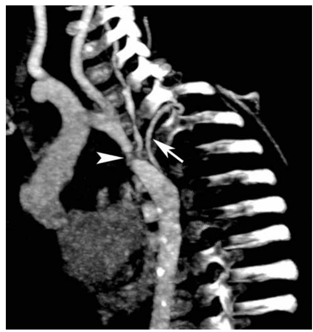
Figure 3. Maximum intensity projection shows coarctation of aorta distal to the origin of the left subclavian artery (arrowhead) and collateral of the internal mammarian artery (arrow) in a 10-year-old boy.

of the fast scanning, MSCT is preferable when there is a severe illness or life-threatening situation. Also, it presents minimal invasive mortality and morbidity risks.<sup>[8,9]</sup> Contrary to conventional angiography, potential interventional complications (dissection, occlusion, bleeding, etc.) are absent. It is easily applied in the case of bleeding diathesis. Conventional angiography has