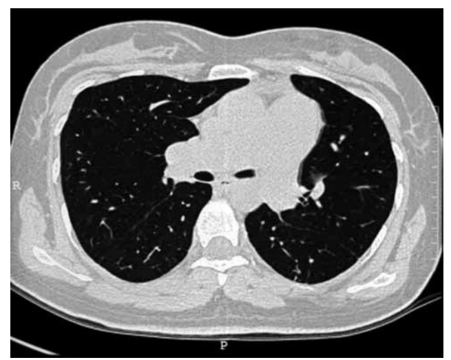
Figure 1. High resolution computed tomographic view of the patient.

heart chambers. We did not find any residual ductal flow. Other diagnostic evaluations examining rheumatologic, hematologic, and pulmonary functions, including the diffusion capacity of carbon monoxide, yielded no evidence for other diseases that might cause PAH, such as scleroderma or parenchymal lung diseases. Her high-resolution chest computed tomography (CT) was normal, except for mild enlargement of the pulmonary truncus and the left and right main pulmonary arteries (Figure 1). However, ventilation-perfusion scintigraphy revealed hypoperfusion on her left lung, suggesting chronic thromboemboli (Figure 2). Her six-minute walk test was 300 m. We performed cardiac catheterization and detected no residual shunt. Pulmonary angiography revealed enlarged left and right main pulmonary arteries