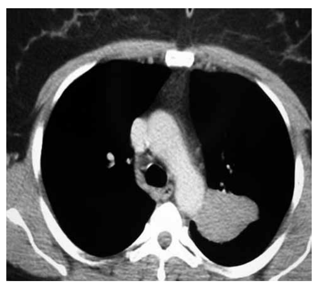
Figure 1. Computed tomography scan shows a circumscribed tumor in the left upper lobe that abuts the mediastinum at the level of the aortic arch.

normal. A pulmonary function test was compatible with anatomic resection. A left posterolateral thoracotomy was performed, and a well-circumscribed, visceral, pleurabased mass of 4x6 cm in diameter was located in the upper area of the major fissure. The mass was attached by a pedunculus to the underlying visceral pleural surface of the left lower lobe. A resection of the tumor with a combined wedge resection of the left lower lobe was performed. At the time of surgery, no other lesions were noted in the lung, pleura, chest surface, or mediastinum. Macroscopically, a rubbery, bright, grey-white mass attached by a pedunculus of 1 cm to the underlying serosal membrane was noted. A histopathological examination demonstrated that the tumor had cord-like, atypical,