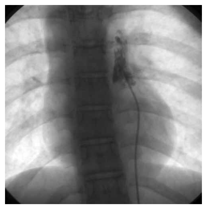
Figure 1. A cardiac catheterization study showing the catheter in the left-sided morphological right atrium.

On cardiopulmonary bypass with bicaval cannulation, the left-sided morphological right atrium was opened by a surgeon operating from the left side. There was a right superior vena cava in addition to a left-sided superior vena cava and an inferior vena cava, which was managed with a sump sucker in the coronary sinus. The ventricular septal defect was closed with a double velour