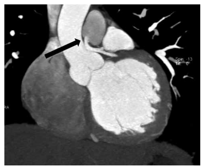
Figure 1. Preoperative coronal maximum intensity projection showing the computed tomography angiography image which revealed the left main coronary artery originating from the pulmonary artery (arrow).

All of the seven patients underwent the Takeuchi operation combined with pulmonary artery reconstruction in our clinic,, and informed consent was obtained from the parents of the patients before surgery. In this procedure, a cardiopulmonary bypass (CPB) was established by aorto-bicaval cannulation. After the replacement of both the aortic root vent and the right superior pulmonary vein vent, blood cardioplegia was initiated. Under CPB, a pulmonary arteriotomy was performed, and the ostium of the left main coronary artery was observed. Then an aortopulmonary window was made, and an intrapulmonary tunnel extending from the anomalous ostium to the window was created via pericardial patch (Figures 2 and 3). At the end of the anastomosis, the pulmonary artery was enlarged using a Dacron patch. Stenosis of the left main coronary artery ostium was present in one patient (patient number 1); hence, coronary artery bypass grafting (CABG) was combined along with the surgical intervention. Ligation of patent ductus arteriosus (PDA) was performed during the surgery in another patient (patient number 4). Detailed postoperative cardiovascular examinations comprised