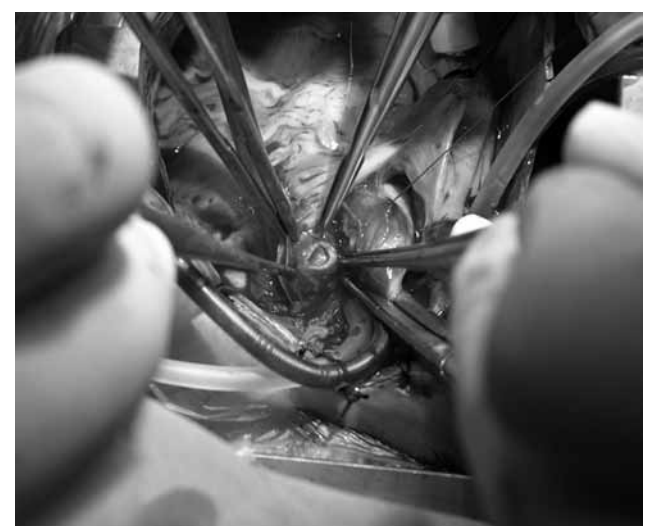
Figure 2. Creation of the aortopulmonary window.

of electrocardiography, a chest roentgenogram, ECG, and CT coronary angiography (Figure 4) were then performed and recorded for statistical analysis at postoperative six-month intervals by pediatric cardiologists.