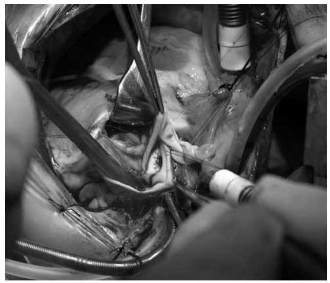
Figure 3. Creation of the intrapulmonary tunnel extending from the anomalous ostium to the window via pericardial patch.

Symptoms at referral were periodic dyspnea in four patients (57.1%) and cardiac arrest in another (14.3%). However, two of these (28.6%) were asymptomatic. Concomitant systemic pathologies were thrombocytosis in one patient (14.3%), hydronephrosis in one (14.3%) and sepsis in another (14.3%). Five patients had ALCAPA that occurred in isolation (71.4%). One of these (14.3%) had PDA and one (14.3%) had pulmonary hypertension. Due to the lack of specificity in the clinical manifestations, five patients in our study population (71.4%) had a false initial diagnosis. The diagnoses at referral were dilated cardiomyopathy in three patients (42.9%), atrial septal defect in one (14.3%), and coronary arteriovenous fistula with mitral valve prolapse in another (14.3%). On preoperative ECG, the mean left ventricular ejection fraction (LVEF) and the left ventricular end-diastolic diameter (LVEDD) were measured as 47.3±11.3% and 36.4±6.0 mm, respectively. The preoperative mean pulmonary artery diameter (PAD) was measured as 15.7±1.0 mm