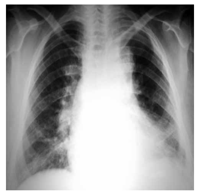
Figure 3. Postoperative chest radiography.

Liposarcomas account for 10-12% of soft tissue tumors in adults. The peak incidence occurs with