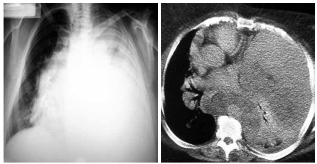
Figure 1. In the chest radiography, there was a completely radioopaque left hemithorax and right mediastinal shift. A computed tomography scan showed the thorax with a giant mass in the left hemithorax.

fiberoptic bronchoscopic examination, and a decision was made to perform an explorative thoracotomy. In the exploration, a solid mass was observed that filled up the entire hemithorax. The tumor mass biopsy was sent for frozen section examination, which was reported to be malignant. The tumor was found to be very close to the heart, mediastinum, and main vessels; however, there was no invasion. Subsequently, the tumor was stripped and removed, from the pleural cavity, along with an adventitial layer of the thoracic aorta, to reduce the pressure on the great vessels and the heart. The pathological specimen size was 20x10x6 cm, and the total weight was 2500 grams (Figure 2). It was multilobular and well encapsulated. The larger fragment was continuous with the inferior