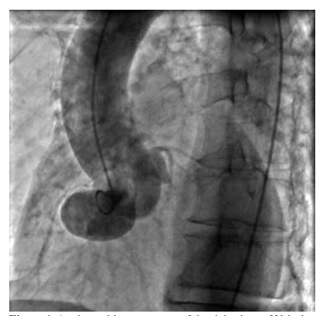
Figure 1. Angiographic appearance of the right sinus of Valsalva aneurysm.

A median sternotomy was performed, and the left internal mammary artery (LIMA) was released. Cardiopulmonary bypass (CPB) was established after placing an arterial cannula into the ascending aorta and bicaval venous cannulations. The ascending aorta was then clamped. Next, the heart was arrested with cold crystalloid cardioplegia. The LIMA-CxOM1 coronary bypass was performed, and the flow in the LIMA was cut using a bulldog clamp. An aortotomy was made transversely, and the aorta along with the left and noncoronary sinus of Valsalva were normal. The right coronary sinus of Valsalva was aneurysmatic, but the right and all other aortic annuli as well as the aortic valve were normal. An aneurysmal sac of about 4x3.5x3 cm