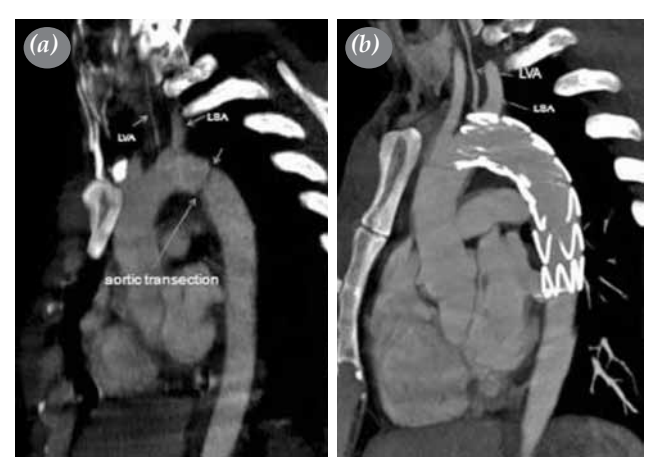
Figure 2. (a) Computed tomography image of the traumatic aortic transection in a 26-year-old male; (b) Control computed tomography image 15 months after the procedure.