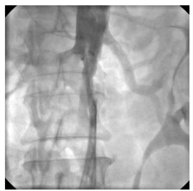
Figure 1. Hypodense thrombus material starting at the level of the renal arteries can be seen by the contrast-enhanced abdominal computed tomography.

and the gangrenous process started at the foot on the third day. Vascular surgery for removal of the thrombus along with amputation of the left leg at the knee were obligatorily performed.