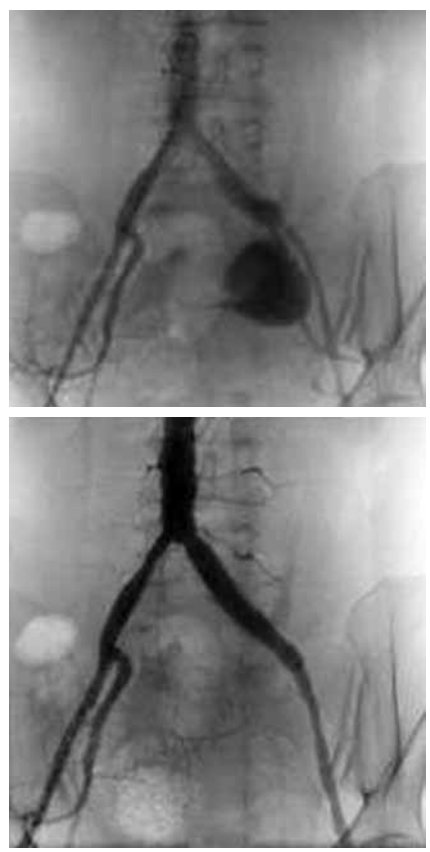
Figure 2. Digital subtraction angiography showing the treated ruptured internal iliac artery via endovascular stenting.

A retroperitoneal rupture of an IAA may be contained, but intraperitoneal rupture can lead to rapid death. An aneurysm rupture may be the first presentation with hypotension occurring along with abdominal, groin, and thigh pain. To our knowledge, a hemothorax related to IAA rupture has not been previously