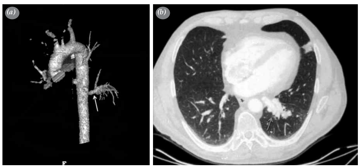
Figure 2. (a) Three-dimensional volume-rendering computed tomography angiography showing the aberrant arterial vascular structure (arrow) originating from the distal thoracic aorta and irrigating the sequestration tissue. (b) A view of the sequestration (arrow) in computed tomography angiography.

the previous literature. Our patient administered to the clinic with a persistent cough, and we identified a right tracheal bronchus, a pulmonary sequestration in the left lung inferior lobe, and an azygos lobe in the apical segment of the right lung.