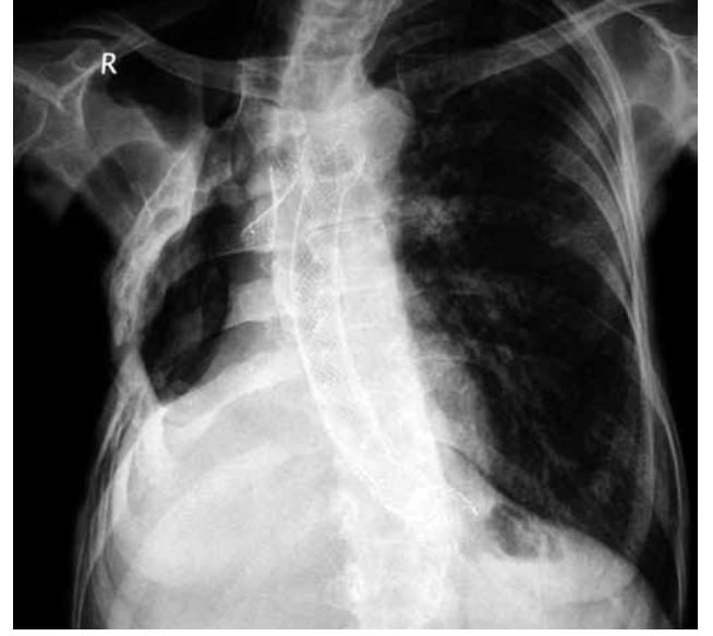
Figure 2. A chest X-ray shows two stents. One was for the closure of the bronchial fistula "hour-glass stent, and the other was for the esophageal fistula that had been previously performed.