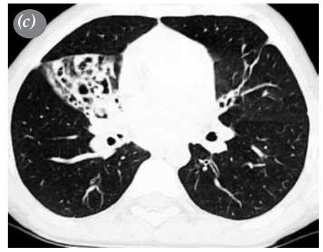
Figure 1. Middle lobe syndrome as seen via (a) Chest X-ray, (b) lateral view, and (c) computed tomography.

incomplete fissures around the right middle lobe prevent the rapid resolution of inflammation. Thus, the absence of collateral ventilation in patients with complete fissures reduces the risk of a more serious condition.