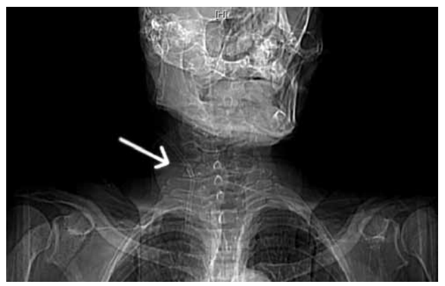
Figure 1. A scanogram of the patient shows the extraordinary route of the central venous catheter (white arrow).

we speculated that these symptoms might be related to a mild brachial plexus injury due to the position of the arm during surgery or an injury caused by the needle during the jugular venous access trial and expected them to resolve after a short period of time. However, on the first postoperative day, after deciding to remove the catheter, we felt an atypical resistance during the removal attempt and observed that the pain and numbness increased when we touched the catheter. We suspected malposition of the catheter and decided to visualize its position radiologically. A chest X-ray showed a deep, unusual route for the catheter but did not help us localize the exact position. A scanogram was then performed which revealed that the catheter was in the right vertebral vein (Figure 1). An axial computed tomography (CT) scan also showed the catheter in the same location (Figure 2).