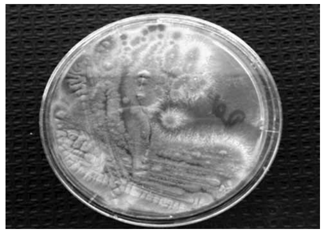
Figure 3. Aspergillus fumigatus colonies on a Sabouraud dextrose agar plate inoculated with the patient's excised vegetation.

day and began oral feeding. Intravenous antibiotic and antifungal therapy was begun with the same protocol that had been performed preoperatively. The early postoperative period was uneventful, and all blood cultures remained negative. At the end of the second postoperative day, a generalized convulsion began which was followed by pulmonary arrest and bradycardia. Resuscitation was initiated, but the patient failed to respond and died. A culture of the intraoperatively excised mass grew pure cultures of Aspergillus fumigatus (Figure 3).