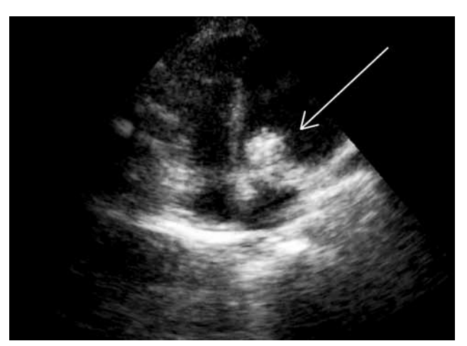
Figure 1. A transthoracic echocardiogram demonstrating a 19x14 mm vegetation in the subaortic position.

The patient was then admitted to our facility to undergo the recommended surgical procedure. His temperature was 36.8 °C, and he had a pulse rate of 106 beats per minute, blood pressure of 90/50 mmHg, and a respiratory rate of 26 breaths per minute. His heart sounds were regular, and a grade 2/6 systolic murmur was audible on auscultation with a loud S1 and split S2. In addition, no evidence of peripheral or central cyanosis, clubbing, or peripheral stigmata of endocarditis was found during the physical examination. However, left hemiplegia and left facial paralysis were present.