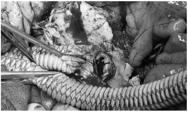
Figure 5. The main body of the stent graft was removed, and the Dacron graft leg was anostomosed to the stent graft limb.