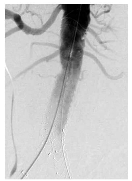
Figure 4. The final angiography showed no endoleaks, and the left renal artery was not visualized after the endovascular graft placement.

supraceliac abdominal aorta was clamped, and the aneurysm sac was opened. After the evacuation of a large amount of thrombus, the main trunk of the stent graft was clamped just above the bifurcation to stop back bleeding from the iliac arteries. Despite a generous aortotomy, the extreme external force of the aortic cuff made removing it quite difficult, which necessitated significant traction. The distal limbs of the stent graft were well embedded in the iliac arteries and were left in-situ since an attempt to remove them by extreme traction could have