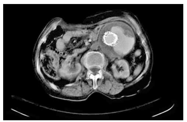
Figure 1. A proximal type 1 endoleak due to the disconnection of the aortic cuff from the main body.

Therefore, we decided to perform an open repair. A midline laparotomy was performed, and the retroperitoneum was exposed. Proximal control of the abdominal aorta was obtained just above the renal arteries with the aid of nylon tape by looping it around the aorta. No fibrotic reaction was encountered nor were dense adhesions seen during the dissection of the proximal neck. However, the dissection of the distal end of the aorta and iliac arteries was difficult due to dense fibrosis; thus, we did not encircle the distal iliac arteries to control distal back bleeding. Next, the proximal aorta was clamped above the renal arteries, and the aneurysm sac was opened. The thrombus around the stent graft was then evacuated, and the previously deployed aortic extension was removed via gentle traction. The back bleeding from the iliac arteries was controlled by clamping the main body of the stent graft, and the proximal neck of the aneurysm was freed from the adjacent structures and prepared for anastomosis. A 24 mm Dacron graft was then anastomosed to the infrarenal segment of the native aorta. Because the distal limbs of the stent graft were well incorporated into the iliac arteries and no back-bleeding was observed between the stent graft and the native iliac artery orifices, we decided to