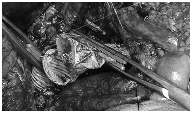
Figure 3. An operative view showing the Dacron tube graft anastomosed to the aorta using an end-to-end technique. The distal end of the Dacron graft was then anastomosed to the stent graft.

supraceliac abdominal aorta was clamped, and the aneurysm sac was opened. After the evacuation of a large amount of thrombus, the main trunk of the stent graft was clamped just above the bifurcation to stop back bleeding from the iliac arteries. Despite a generous aortotomy, the extreme external force of the aortic cuff made removing it quite difficult, which necessitated significant traction. The distal limbs of the stent graft were well embedded in the iliac arteries and were left in-situ since an attempt to remove them by extreme traction could have