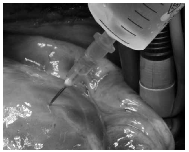
Figure 3. The hydatid cyst fluid was aspirated during the surgery.