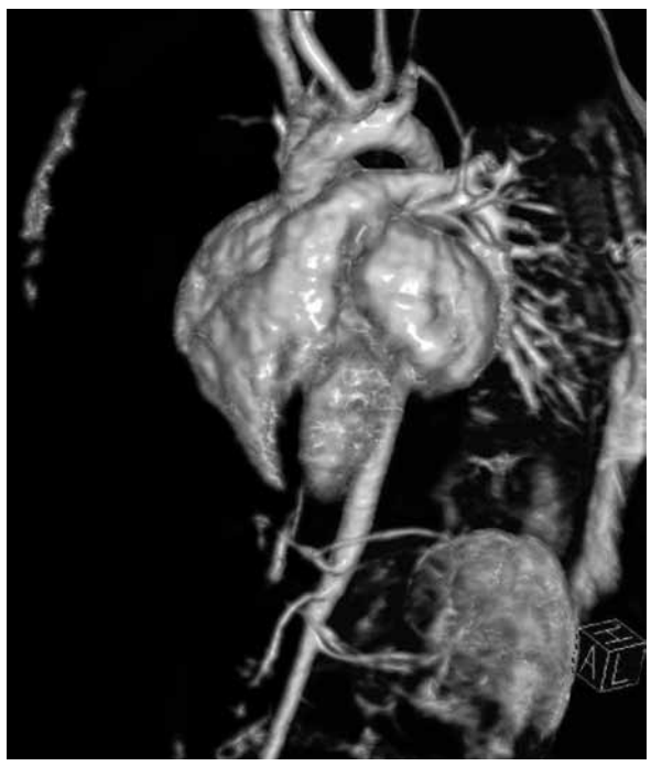
Figure 2. Magnetic resonance imaging of the left atrial aneurysm.

Pathologic examination demonstrated full layers of endocardial, myocardium and the epicardium with focal subendocardial fibrous hyalinization, which were