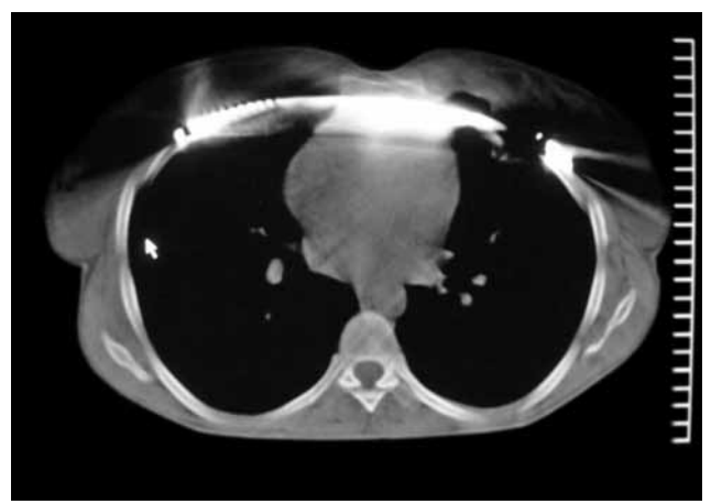
Figure 2. Postoperative thoracic computed tomography showing the elevated sternum by the pectus bar. No signs of a pericardial effusion were present.

Echocardiography is the most available and reliable technique to verify the presence and amount of PCE.