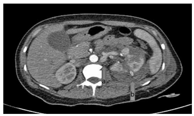
Figure 1. (a) Retroaortic left renal vein. (b) Vascular congestion appearance.

given treatments for a urinary tract infection (UTI) and kidney stones as a result of some routine tests. Her proteinuria level was 201.67 mg/day (normal value is <140 mg/day) during a 24-hour urine analysis. In addition, minimal fluid in the pelvis, right-sided pelvicalyceal dilatation [ureteropelvic (UP) obstruction], and right nephrolitiasis were found during an abdominopelvic tomographic examination performed after the routine tests. Furthermore, vascular congestion appearance extending from the pelvis at the retroperitoneal space on the left side, free fluid in the pelvis, dilated gonadal veins, and dilated tortuous vascular structures in the left half of the pelvis (pelvic congestion) were also observed (Figure 1). Based on these results, single-sided selective renal angiography was performed in order to elucidate the etiology completely. It was observed that the renal vein was patent but that it continued between the abdominal aorta and vertebra by narrowing severely. Moreover, the left gonadal vein was severely dilated from the point where it emptied into the renal vein until it reached the pelvis. The patient was then diagnosed with posterior NCS. The dilated tortuous veins compatible with pelvic congestion were detected in the pelvic