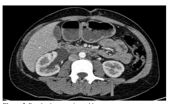
Figure 3. Resolved retroperitoneal hematoma.