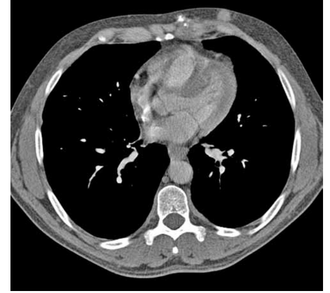
Figure 3. Contrast-enhanced computed tomography showing the centrally calcified and non-calcified nodules on the subcutaneous fat tissue. The soft tissue mass eroding the sternum had disappeared.