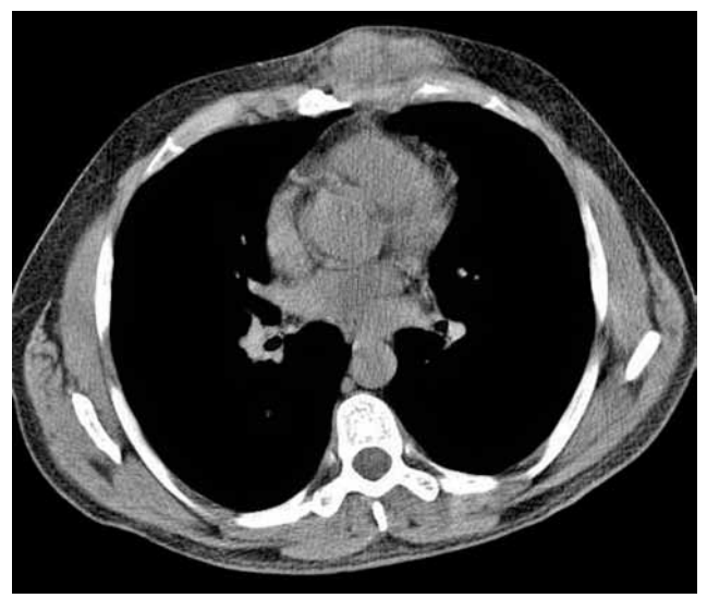
Figure 1. Non-contrast-enhanced computed tomography showing the soft tissue mass eroding the sternum.

tomography (CT) of the thorax had demonstrated a 6.7x4.2 cm lobulated soft tissue mass that was eroding the sternum (Figure 1). However, ultrasoundguided fine needle aspiration (FNA) had yielded no microorganisms, and the cytology had revealed polymorphonuclear leucocytes.