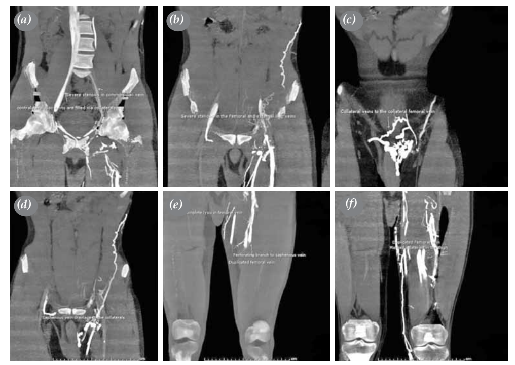
Figure 2. Control computed tomographic venography of a patient eight months after the procedure.

thrombolytic infusion, which was due to the decreased fibrinogen levels. Although no statistical significance was noted, none of these patients suffered from venous insufficiency.