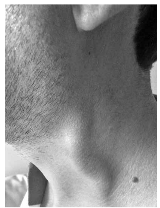
Figure 1. The image of the external morphology of the arteriovenous fistula (engorged jugular vein predominantly visualized).

The treatment of acquired AV fistulas is primarily surgical. Interruption of the connection between the artery and vein is sufficient for recovery. Existing vascular defects should be also repaired. Compression with the Doppler ultrasound (DUS) probe for 30 to 45 minutes over the AV fistulas was reported to be useful for the catheterization-induced iatrogenic cases. In addition, the graft coated stents may be used in certain regions. Therapeutic embolization may be used in pseudoaneurysms or in cases who are not candidate for surgery.<sup>[11]</sup> Insisted effort to perform open surgery in inappropriate patients may result in exposure difficulties, intraoperative hemorrhage, tissue damage, and postoperative scar development.