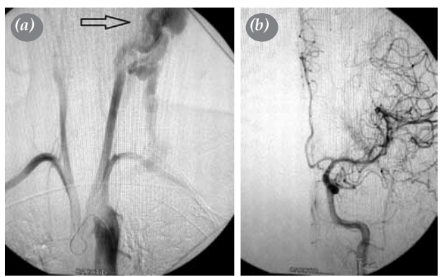
Figure 4. Arteriography before ( a ) and after ( b ) the endovascular treatment (arrow pointing the initial facial aneurysm) (images were taken in cranial-18 degree of angle).