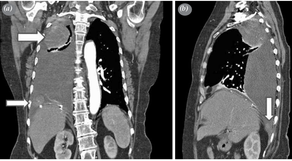
Figure 1. Computed tomography. (a) An apical mass of 6.0x6.0 cm, a diaphragmatic mass of 3.0x3.0 cm with massive pleural effusion. (b) A third mass of 2.0x1.0 cm located on deep posterior part of diaphragm. Masses are shown with arrows.

effusion (Figure 1a, b). Thoracentesis demonstrated an exudative fluid. Nucleated cell count was 1000/mm<sup>3</sup> (52% lymphocytes), total protein concentration was 45 g/dL (a pleural fluid-to-serum ratio of 0.63), lactate dehydrogenase level was 528 IU/L, and glucose level was 92 mg/dL. Cytological examination detected no tumoral cells, and the fluid culture results were negative. A video-assisted thoracoscopic surgery was planned for diagnosis.