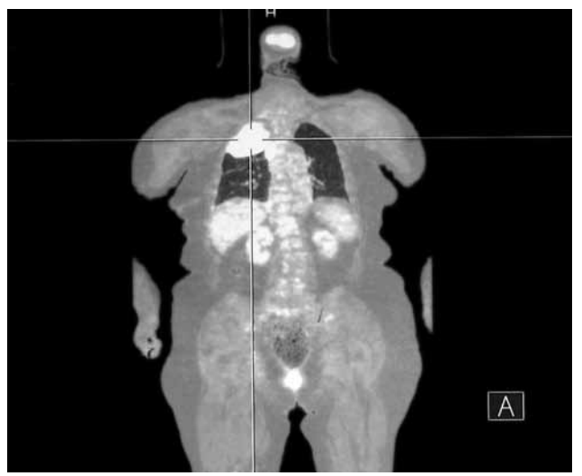
Figure 3. Positron emission tomography-computed tomography demonstrating apical mass lesion as the only pathologically metabolically active lesion in body with a maximum standardized uptake value of 9.3.

metastatic disease, a positron emission tomography was performed. The maximum standardized uptake value of the remaining apical lesion was 9.3, and since there was no other possible tumor focus, the final diagnosis was a PPL (Figure 3). The patient underwent an axillary thoracotomy after one month, and the apical lesion was totally excised. The pathological examination was consistent with the previous ones, with clear surgical margins. The patient was discharged three days after the surgery. Since the surgical margins were negative, and the patient was old, postoperative chemotherapy and/or radiotherapy were not given. The patient is alive and without recurrence after a follow-up of 17 months.