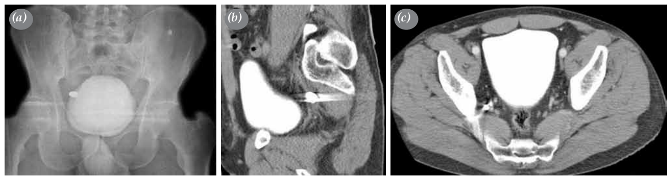
Figure 2. (a) Bullet-like opacity in pelvic radiography, (b, c) coronal and sagittal section of pelvic computed tomography demonstrating bullet close to internal iliac vascular bundle.

triangular area named Bochdalek's triangle in 90.1% of the cadavers, and proposed that this triangle comprising of 622.8 mm<sup>2</sup> may allow communication between the pleural cavity and the retroperitoneal space.<sup>[4]</sup> Habal et al.<sup>[5]</sup> reported a case in which a titanium rod, used for stabilization of fracture of the first lumbar vertebrae, migrated into the left pleural space. In the thoracoscopy, the authors found the rod lying in posterior costophrenic angle without any evidence of diaphragmatic injury. It is possible that the rod migrated using the pathway described above.<sup>[4]</sup>