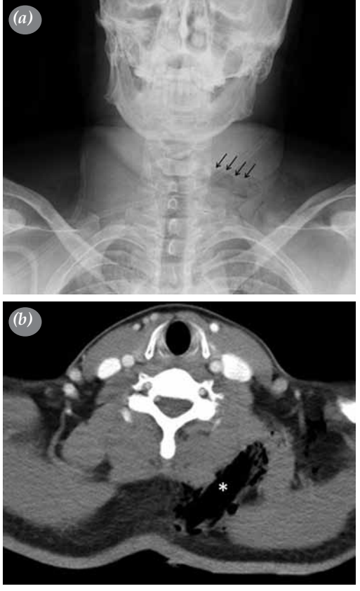
Figure 1. (a) Posteroanterior cervical radiograph and (b) computed tomography appearance of foreign body.

A 38-year-old male patient presented with chest pain. A tree had fallen onto the patient. There were no neurological deficits. Preoperative anteroposterior radiography of the neck showed a radiolucent foreign body in the posterior paravertebral space (Figure 1a). Contrast-enhanced axial computed tomography scan showed a foreign body with air density in the posterior