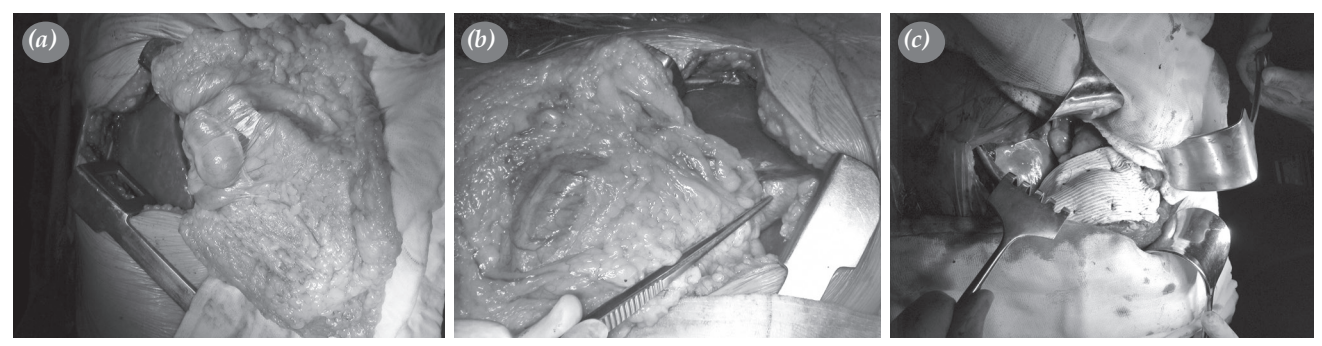
Figure 2. (a) Herniated liver, colon and omentum, (b) additional gall bladder seen at tip of forceps, (c) polytetrafluoroethylene graft after reduction of herniated viscus.