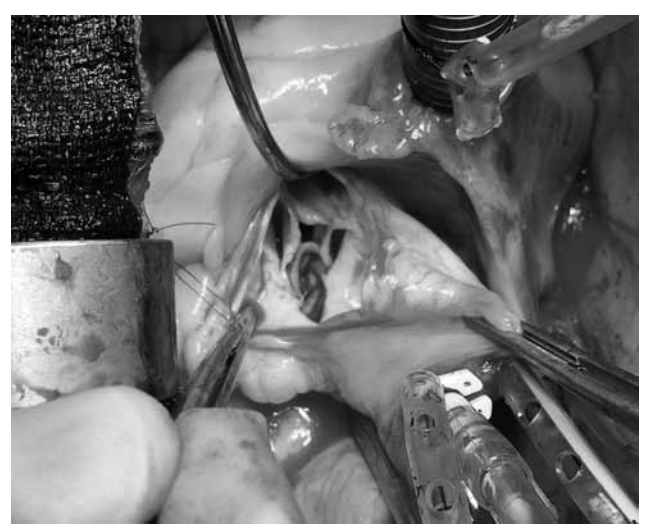
Figure 2. Intraoperative image demonstrating quadricuspid aortic valve in situ .