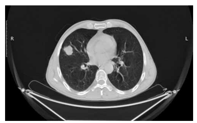
Figure 1. A computed tomography scan showing the mass in the middle lobe.

Following surgery, a 24-Fr chest tube was placed via the same subxiphoid incision (Figure 2). The patient tolerated the whole procedure well without any pain. The chest tube was removed on postoperative Day 3, and the patient was discharged uneventfully. The pathology result was reported as an adenocarcinoma.