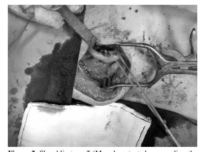
Figure 2. Shamblin type 2 (Mass has started surrounding the vessels).

cauterization or retraction of these nervous structures. Complications such as facial paralysis, bradycardia, nasolabial sulcus erosion, dysphagia, blood pressure irregularities, and heart rhythm disorders can be observed. Bleeding and hematoma may occur due to intense vascular texture of the tumor. Bleeding and hematoma can cause respiratory distress and even difficult intubation, especially after extubation. In this study, neurological and surgical complications of patients who underwent surgery in our clinic due to carotid glomus tumor were evaluated.