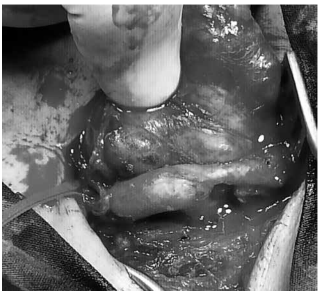
Figure 3. Shamblin type 3 (Mass has completely surrounded the vessels).