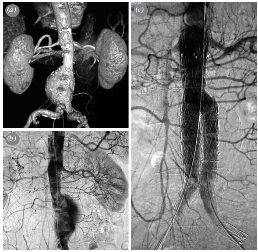
Figure 2. Images of an abdominal aortic aneurysm. (a) Preoperative three-dimensional reconstruction of contrasted computed tomography imaging. (b) An intraoperative double subtracted angiography image. (c) A postoperative double subtracted angiography image.

Duration of total hybrid procedure was 254 min. Extubation duration was six hour. The patient was transferred to his room at postoperative 22 hours and discharged on postoperative Day 7 after an uneventful postoperative follow-up period.