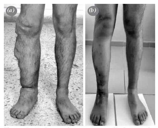
Figure 1. (a) Preoperative appearance. (b) Postoperative appearance after three months.

Bilateral lower extremity venous magnetic resonance angiography showed no pathology in the iliac veins, femoral veins, and saphenous veins. The lesion mainly affected the right lower extremity from just above the knee to the foot (Figure 3). To determine the origin of the venous filling, phlebography was performed which revealed independent venous dilatations. After the completion of preoperative evaluations, a written and informed consent was obtained from the patient, and he underwent operation under regional anesthesia. An incision was made from the lesions located on the foot which was marked preoperatively. Distal small venous lesions which was progressively expanding in proximal were removed by tying or/and cauterizing, gradually. The vascular lesions adhered to the tendons and outspread over the bone tissue were removed by cauterization (Figure 4). It was seen that the vascular lesions on the tibia were small, if they were located