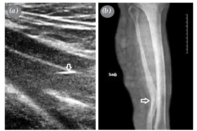
Figure 2. (a) The arrow showing the saphenofemoral valve. (b) The arrow showing the notch on the right fibula.