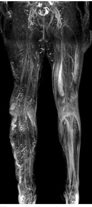
Figure 3. Magnetic resonance venography showing common venous involvement in right leg.

under the fascia and those were greater, if they located over fascia. Soft tissue-weighted lesions were removed by cauterization and vascular lesions were tied with silk sutures. All of the hypertrophic soft tissue and venous dilatations were removed. No bleeding was observed during and following the operation. The patient was discharged on postoperative Day 2 without any complications. The appearance of the right lower extremity became too close to left lower extremity and there was no recurrence three months later after the operation (Figure 1).