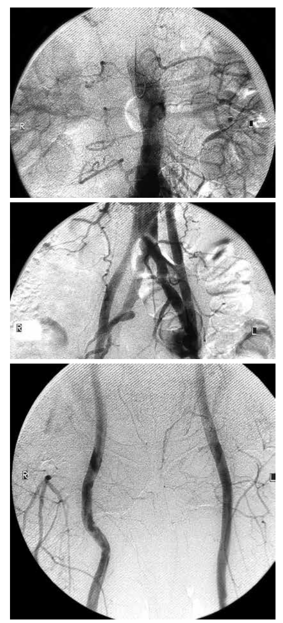
Figure 3. Digital subtraction angiography image at five-year follow-up. The grafts are patent.

A 60-year-old male patient with diabetes presented to our clinic with bilateral groin wounds, bilateral claudication that began after a walking distance of 15-20 meters, and ischemic ulcer on the right third toe. The patient had undergone aortobifemoral bypass due to Leriche's syndrome one year previously.