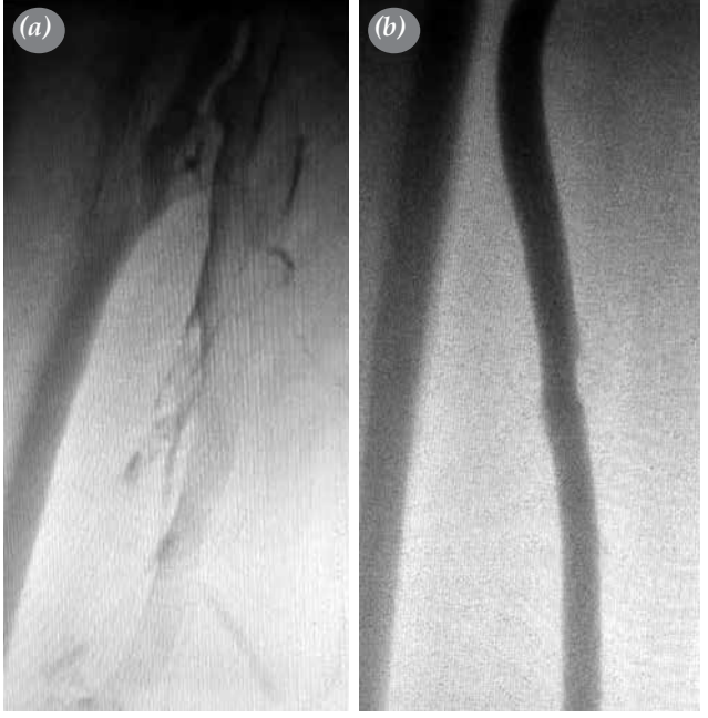
Figure 4. Occlusion of proximal femoral vein (a) before the procedure and (b) complete patency after the procedure.