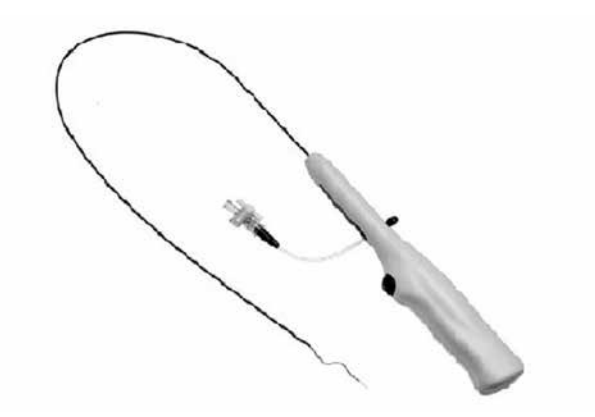
Figure 2. Cleaner<sup>™</sup> machine used for thrombectomy.

20 mg alteplase (Actilyse, Boehringer Ingelheim Pharma GmbH & Co. KG. Biberach/Riss. Germany), as a thrombolytic agent, was given from the device port during the mechanical thrombectomy. Then,