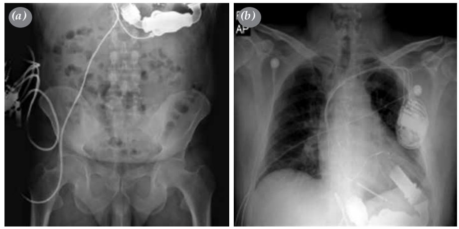
Figure 1. Left and right panels of X-ray showing no visible lesions of driveline and device.