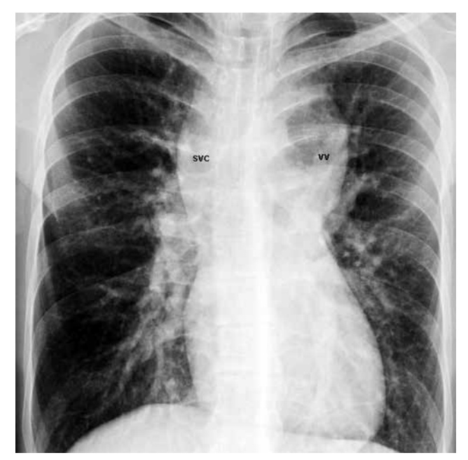
Figure 1. Snowman appearance on chest X-ray. SVC: Superior vena cava; VV: Vertical vein.

incomplete right bundle branch block. Arterial blood gas analysis revealed 80% oxygen saturation in room air. Laboratory tests were normal except for 17.8 mg/dL hemoglobin and transaminase levels (serum aspartate