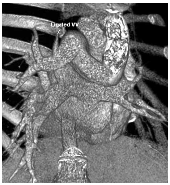
Figure 3. A postoperative three-dimensional, computed tomography angiography three-dimensional image. Ligated vertical vein. VV: Vertical vein.

SVC: Superior vena cava; VV: Vertical vein; BCV: Brachiocephalic vein; PVC: Pulmonary venous chamber.