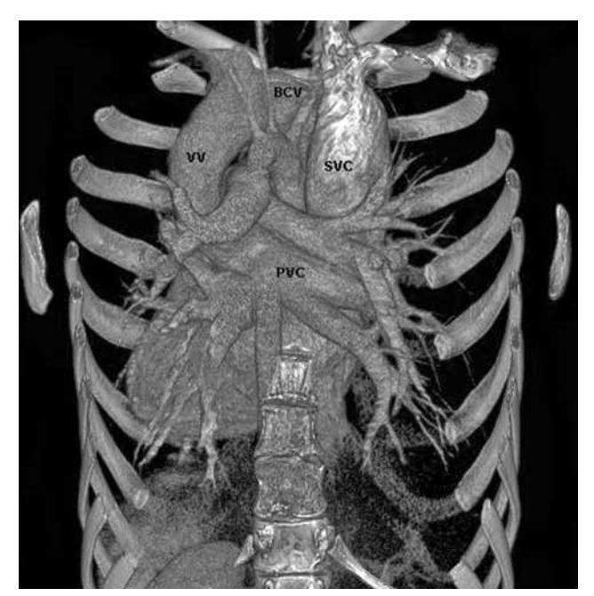
Figure 2. Anomalous connection of pulmonary veins with systemic vein.

A written informed consent was obtained from the patient. He underwent an elective surgery through a median sternotomy. During the operation, following aorto-bicaval cardiopulmonary bypass (CPB), the patient was cooled to 30°C. The aorta was cross-clamped and cardiac arrest was induced with antegrade cold cardioplegic solution. The heart was retracted to the cephalad and right, exposing the left posterior pericardial area. The VV and the cPVC were found behind the pericardium, adjacent to the back of the LA.