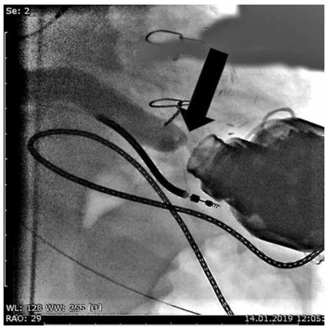
Figure 3. During conventional angiography, contrast material was given retrogradely from aortic inlet following pump stoppage.

exposure, the medial intercostal cartilage was cut and the swivel joint was exposed. The outflow graft protector cuff was removed by its special removal clamp, and a counter-clockwise (approximately 120°) twisted outflow graft was revealed (Figure 4). The outflow graft was turned opposite to its twisting direction from the swivel joint. In addition, the outflow graft protector cuff was re-attached to its original position. Following the rotation, LVAD parameters returned to normal levels. The ECMO was gradually weaned off using transesophageal echocardiography and pulmonary artery pressure monitorization in the operation room. The patient was extubated next day and discharged 15 days after the operation.