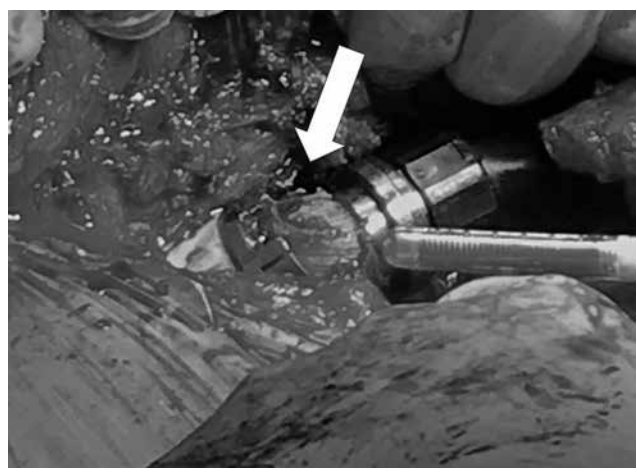
Figure 4. Intraoperative swivel joint and counter clockwise twisted outflow graft.

exposure, the medial intercostal cartilage was cut and the swivel joint was exposed. The outflow graft protector cuff was removed by its special removal clamp, and a counter-clockwise (approximately 120°) twisted outflow graft was revealed (Figure 4). The outflow graft was turned opposite to its twisting direction from the swivel joint. In addition, the outflow graft protector cuff was re-attached to its original position. Following the rotation, LVAD parameters returned to normal levels. The ECMO was gradually weaned off using transesophageal echocardiography and pulmonary artery pressure monitorization in the operation room. The patient was extubated next day and discharged 15 days after the operation.