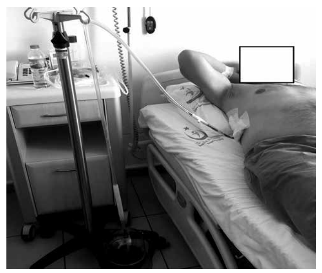
Figure 1. Chest drain is hooked up over a drip-stand allowing air to escape, while blood pleurodesis remains within the chest.

Statistical analysis was performed using the IBM SPSS version 25.0 software (IBM Corp., Armonk, NY, USA). Data were presented in mean \pm standard deviation (SD), median (min-max), or number and frequency. The chi-square test, Fisher's exact test, independent samples t-test, and Mann-Whitney U test