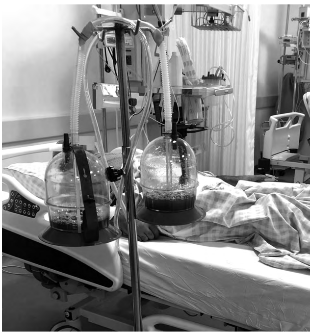
Figure 2. The chest tube was placed at a position above the chest level.

Statistical analysis was performed using PASW for Windows version 17.0 software (SPSS Inc., Chicago, IL, USA). Descriptive data were presented in mean \pm