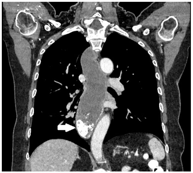
Figure 2. Contrast-enhanced thoracic computed tomography. Narrowing of gastroesophageal junction, uniform dilatation of esophagus along with esophageal contents and residue of barium sulphate (white arrow).