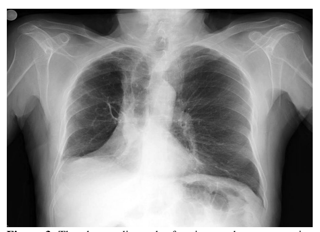
Figure 3. The chest radiograph of patient at the postoperative third month.

was uneventful. The chest tube was removed on the postoperative fifth day, and the patient was discharged on the sixth day. The patient's histopathology report revealed that the tumor 3 cm in diameter invaded the diaphragm superficially but not in full-depth, with N0 status. There were fibrosis and necrosis zones within the tumor. The diagnosis was confirmed as a squamous cell carcinoma, and the immunohistochemical staining result was CK5/6 (+), TTF1 (-), and P63 (+). Since the patient had a T4N0M0 tumor (Stage IIIA), the patient was referred to the oncology department in the postoperative period and received adjuvant therapy. The patient's disease-free follow-up still continues in the ninth postoperative month.