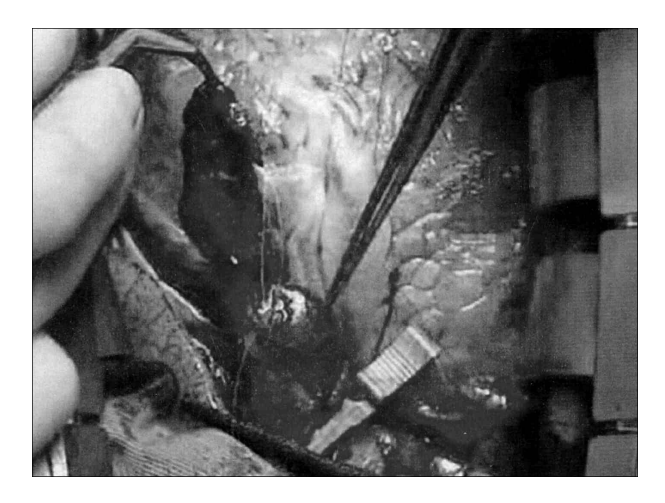
Figure 1. Macroscopic apperence of the lymphadenopathy on the ITA pedicle.

noted, which were almost round in shape, 20-25 mm in diameter and rubbery in consistency (Figure I). These masses were easily removed with sharp dissections and sent to the pathology laboratory. On macroscopic examination the vascular integrity was not impaired. Blood flow in the ITA was measured after dissection of the pedicle which was 144 ml/min while the cardiac index was 3.1 mL/min/m_. Using Octopus Tissue Stabilizer III (Medtronic, Inc., Minneapolis, MN) on beating heart the left ITA was anastomosed to the midportion of LAD. Finally, the operation was ended by standart closing of the chest. Following an uneventful recovery he was discharged from the hospital at the sixth postoperative day.