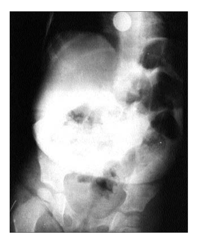
Figure 1. An opaque lesion with well-defined borders located at the mediastinum supradiaphragmatically.

of Poison Center in 1999, a totally 182.105 foreign body ingestion was reported under the age of 20. The precise incidence of ingestion of a foreign body is unknown because most cases have a benign clinical course. They generally resolve without the need for medical care and are thus unreported.