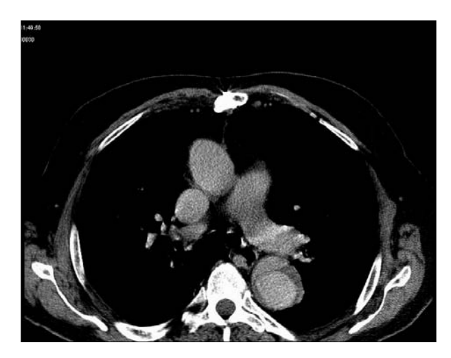
Figure 1. Chronic DeBakey Type III dissection prior to EVAR.